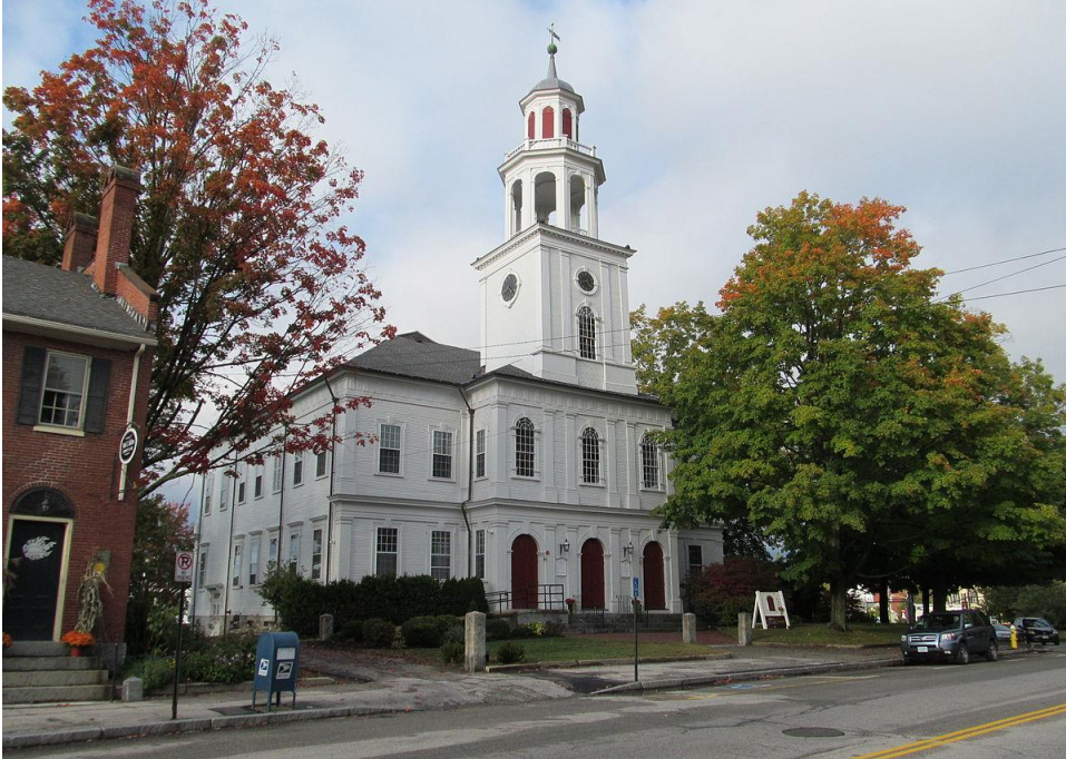
Figure 2. First Parish, Exeter, NH, 1799.