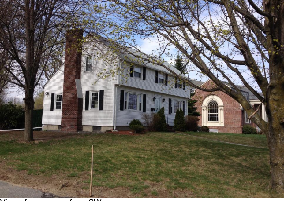
View of parsonage from SW.