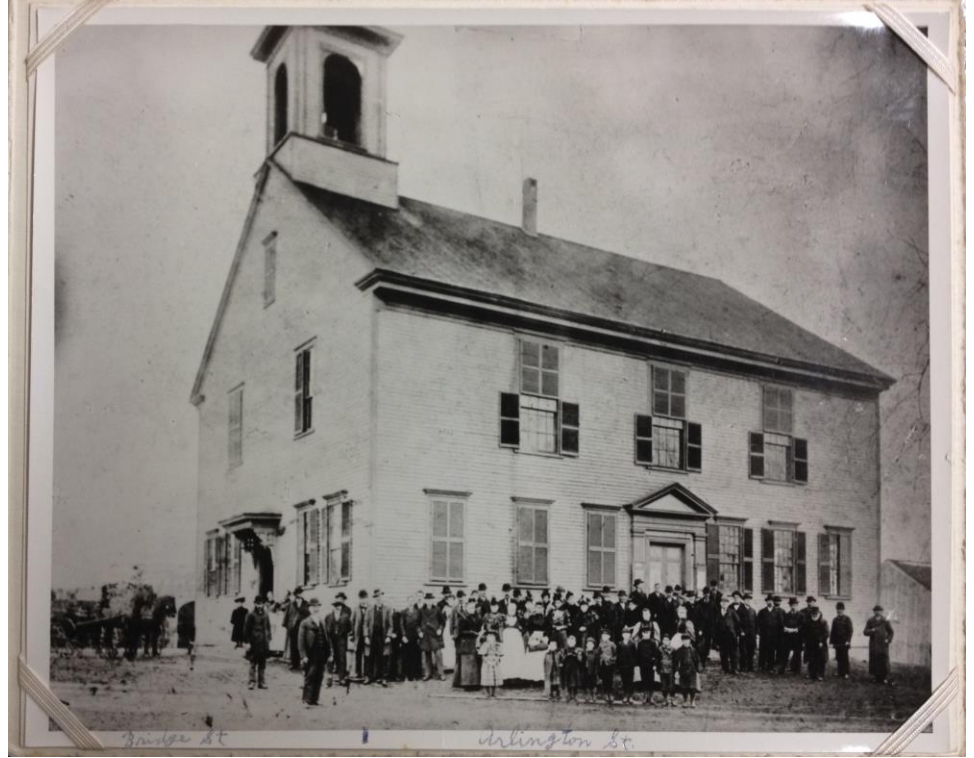
Figure 1. Yellow Meetinghouse before remodeling, 1894.